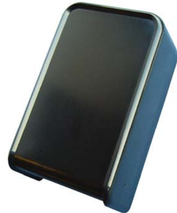
Merlin Graffiti Detector: MGD-S