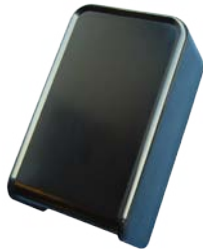
Merlin Graffiti Detector: MGD-S