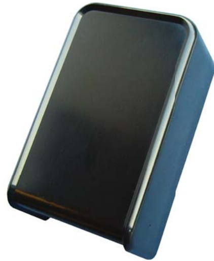
Merlin Graffiti Detector: MGD-S