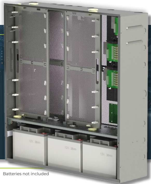
Batteries not included

Enterprise-Grade Access Control Enclosure Engineered by Elmdene